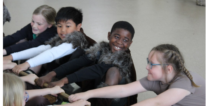
Year 4 learn about Viking rowing techniques

On Tuesday, Year 4 enjoyed a day steeped in Viking history. Many of the children dressed in Viking costume and a few had weaponry to match. Needless to say, plastic axes were not allowed out at breaktime!